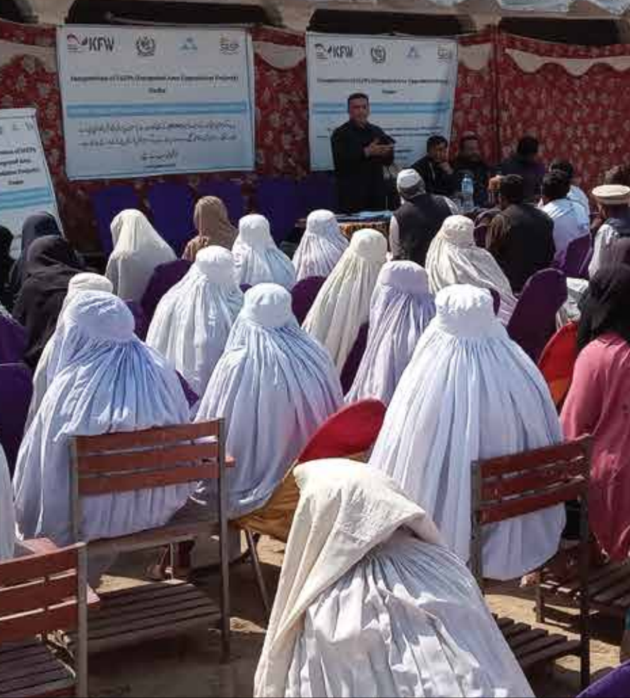
Discussion with community members on project implementation in DI Khan, Khyber Pakhtunkhwa.

LACIP is an integrated poverty reduction programme funded by Federal Republic of Germany through KfW that aims to contribute towards the improvement of living conditions of vulnerable communities by building disaster-resilient Community Physical Infrastructure (CPI) and generating employability through Livelihood Enhancement and Protection interventions with Institutional Development as the basis for all the activities. PPAF is the lead implementing agency of LACIP through its Partner Organisations (POs).